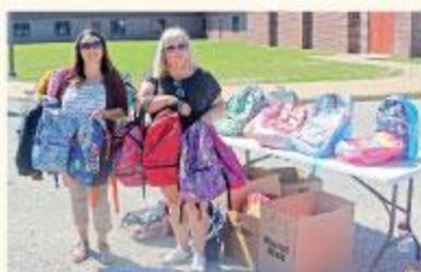
Mackinac County's Project Backpack volunteers distribute backpacks for the drive-thru event