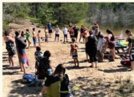
YEA youth learn kayak skills and safety instruction from Health Educators

Sault Tribe Registered Dietitians attended the event and provided a healthy snack to participants.