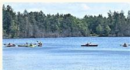
YEA youth practicing kayaking skills on the lake